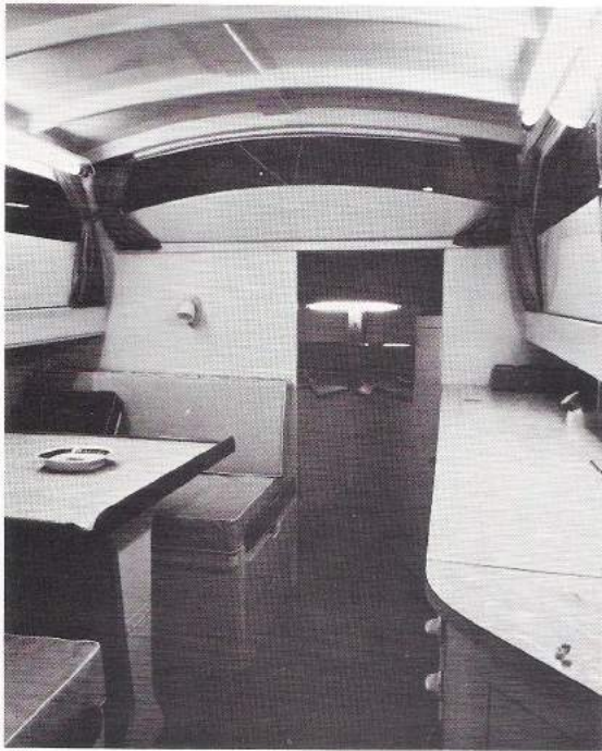
Main cabin looking forward.