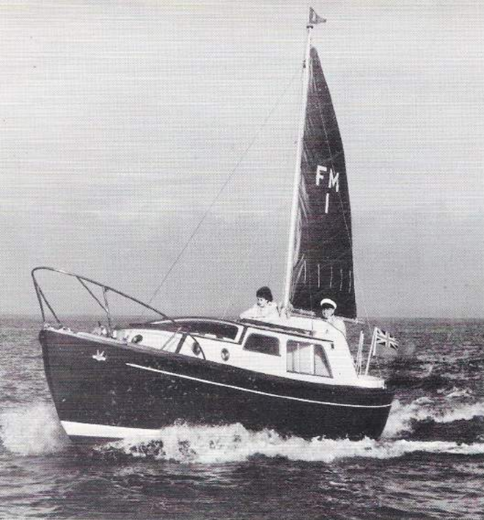
Fisherman 27 with mizzen rig.