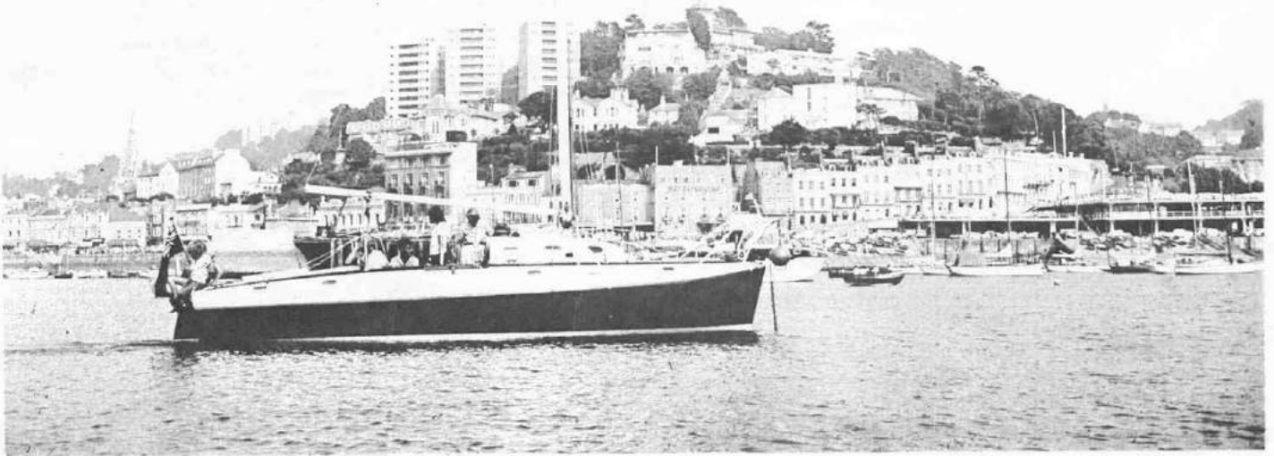
"Kookaburra" at Torquay